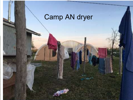
Camp AN dryer