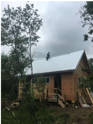
The camp was donated a small sawmill which they use to cut lumber from driftwood logs. This year they were able to make a cabin with rooms for speaker, cook, and other staff.