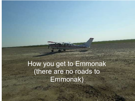
How you get to Emmonak (there are no roads to Emmonak)