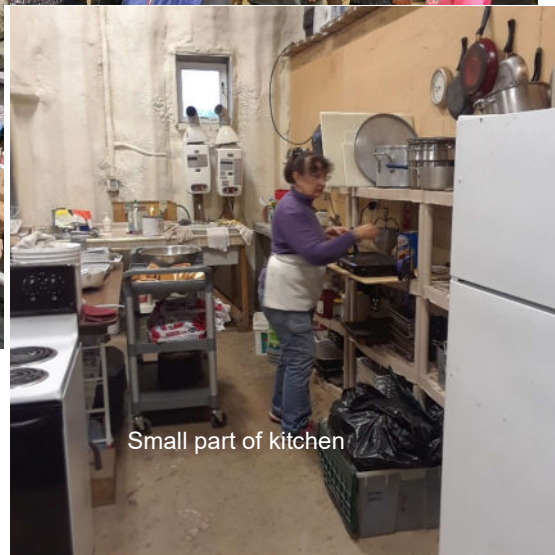
Small part of kitchen