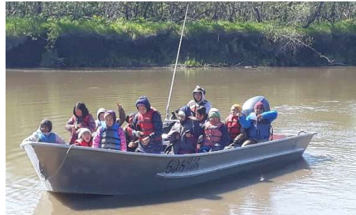
Staff, campers, and all supplies go from Emmonak 17 miles upriver by boat to the camp

Yes Lord, Yes Lord, Yes Yes Lord Yes Lord, Yes Lord, Yes Yes Lord Yes Lord, Yes Lord, Yes Yes Lord Amen