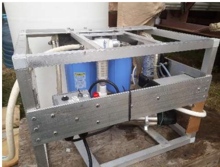
New water purification system (left) replaces hauling drinking and cooking water by boat from Emmonak in 5 gallon jugs. Saves a huge amount on gas.